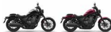
Gunmetal Black Metallic