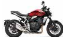
Candy Chromosphere Red