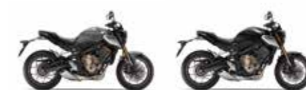
New 2021 Colour Pearl Smoky Gray