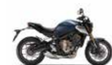
Mat Jeans Blue Metallic