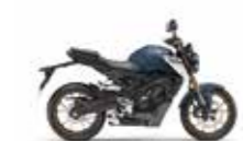
New 2021 Colour Mat Jeans Blue Metallic