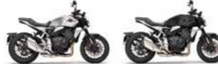
New 2021 Colour Mat Beta Silver Metallic