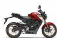
Candy Chromosphere Red