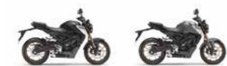
New 2021 Colour Mat Gunpowder Black Metallic