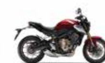
Candy Chromosphere Red